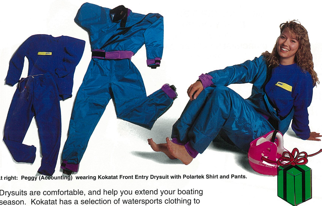
At right: Peggy (Accounting) wearing Kokatat Front Entry Drysuit with Polartek Shirt and Pants.

Drysuits are comfortable, and help you extend your boating season. Kokatat has a selection of watersports clothing to protect you from cold weather conditions. Take advantage of stock on hand, and SAVE!