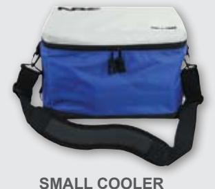
Colors: yellow/gray, blue/gray Size: 14" L x 9" W x 10" H 15 qt. #2750 S / $34.95