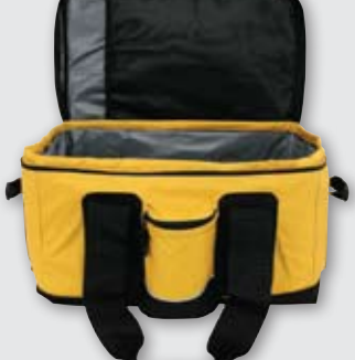
LARGE COOLER Colors: yellow/gray, blue/gray Size: 20 L" x 13" W x 12" H 45 qt. #2750 L / $49.95

The Large cooler has an accessory pocket and sturdy carry handles. The Small and Six Pack sizes come with a wide shoulder strap. The 30-Can Cooler adds a heavy-duty welded urethane bottom and an external pocket.