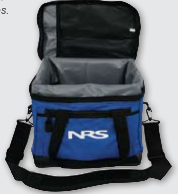
30-CAN COOLER Colors: blue Size: 13.5" L x 9" W x 12" H 18 qt. #2750 30 / $44.95