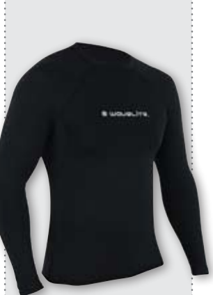
NRS MEN'S WAVELITE SHIRT

Color: black Size: S-XXL #25513 / $49.95 NOW: $39.95