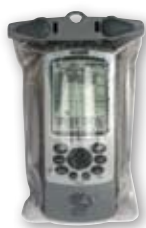
348 SMALL WHANGANUI

Color: clear Size: 5"L x 6" Circum. #55303.02 / $30.00