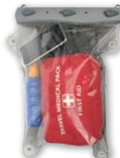
668 LARGE WHANGANUI

Color: clear Size: 8"L x 10.5" Circum. #55330.01 / $32.00