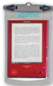
658 MED WHANGANUI

Color: clear Size: 6"L x 8" Circum. #55306.03 / $30.00