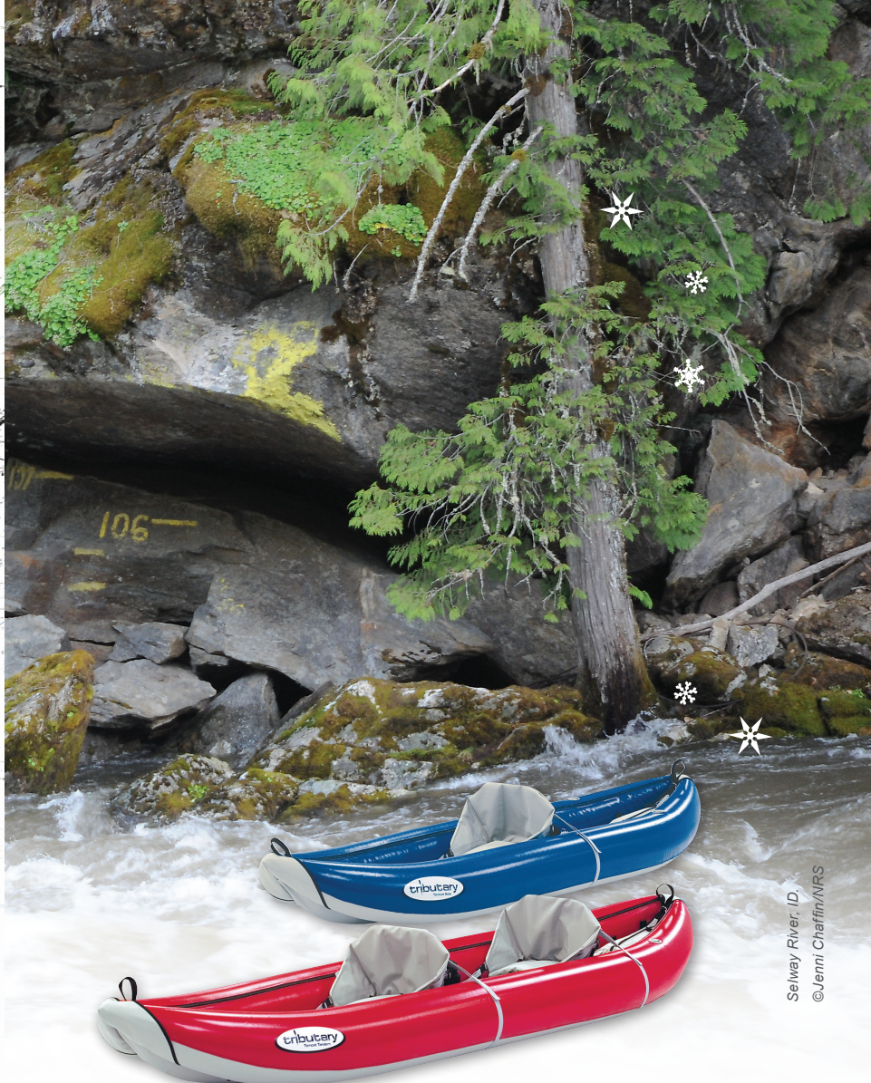
Selway River, ID.

COVER: Janelle, NRS Customer Service, paddling tranquil Priest Lake, ID.