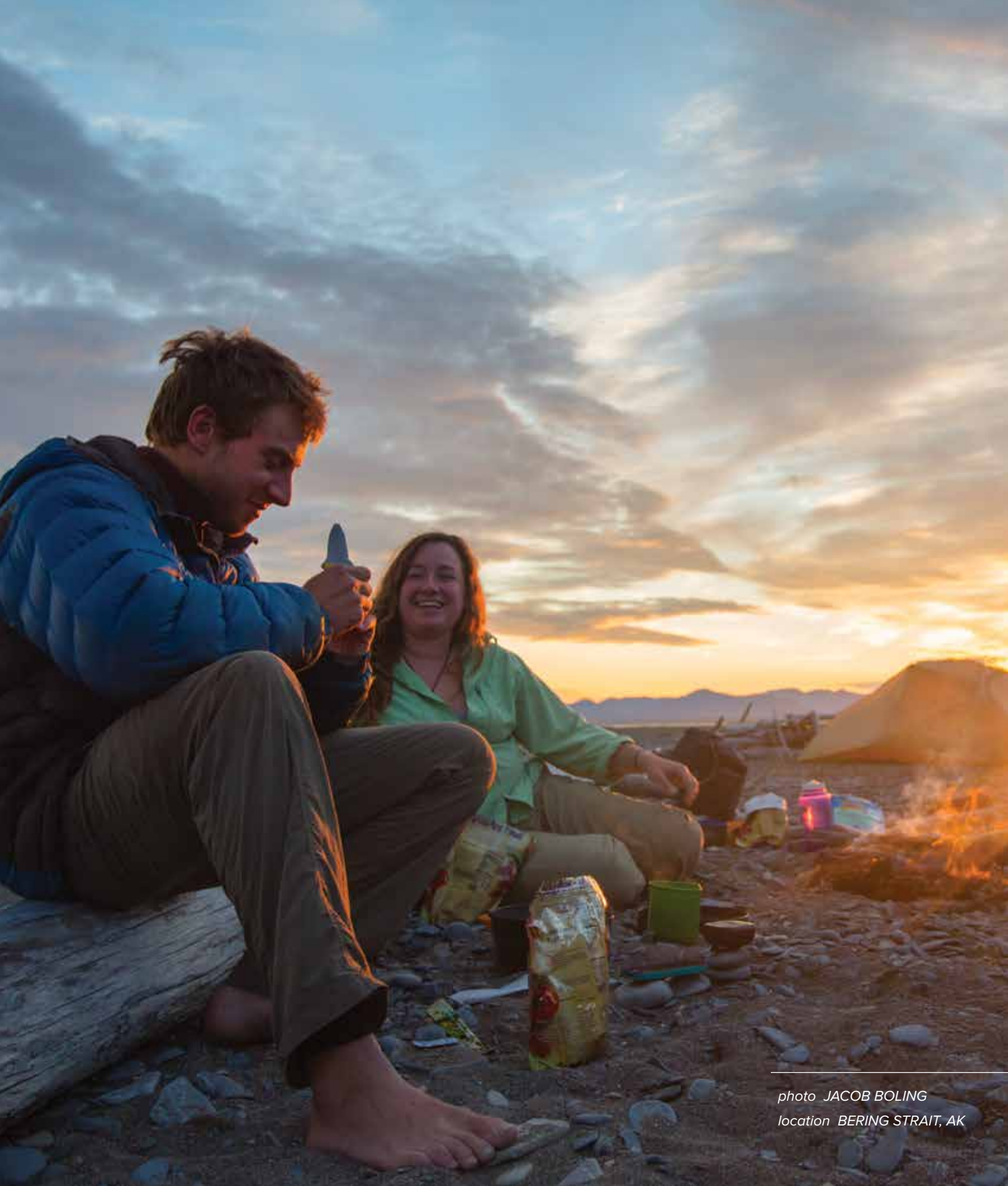
location BERING STRAIT, AK