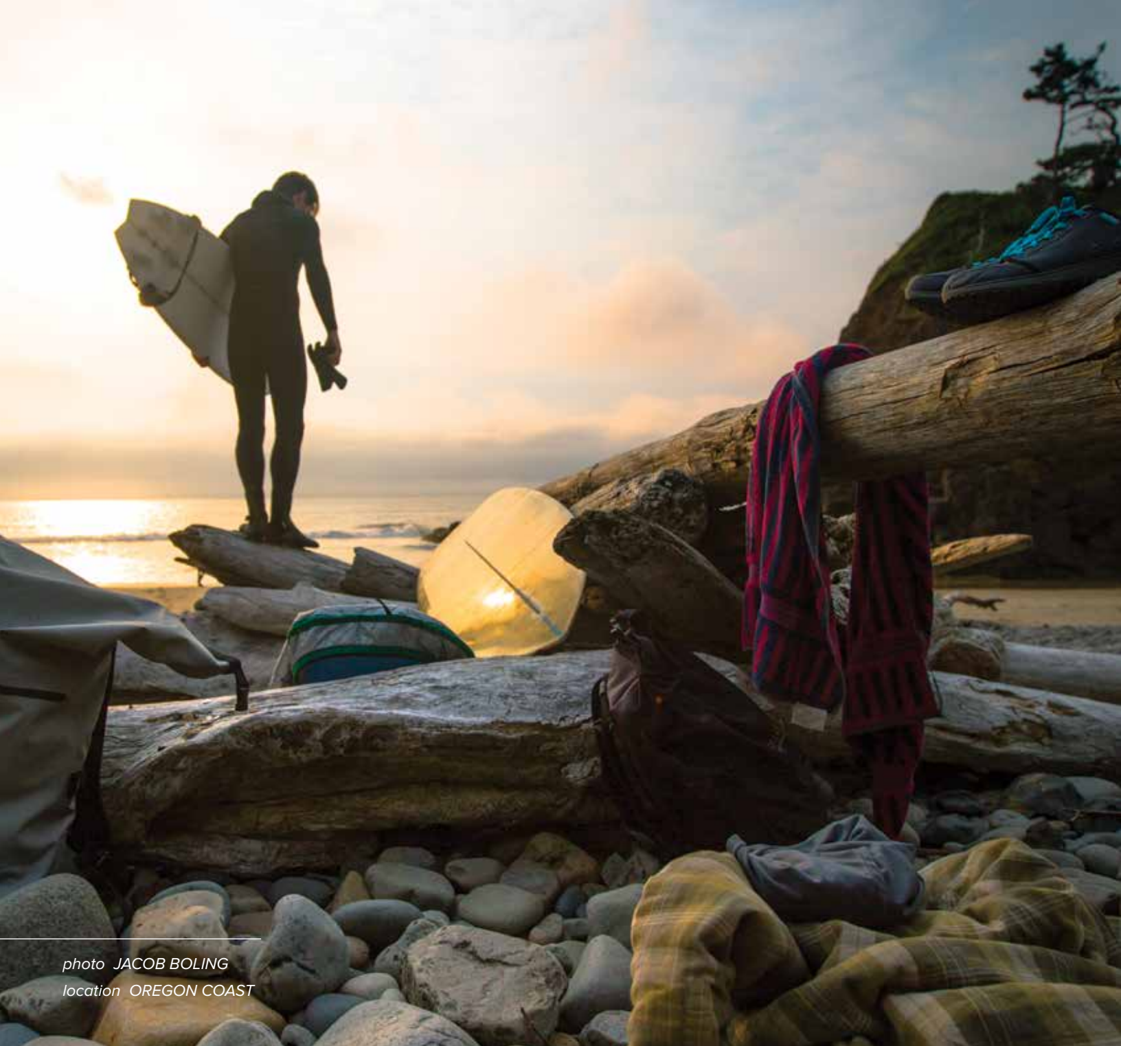
location OREGON COAST