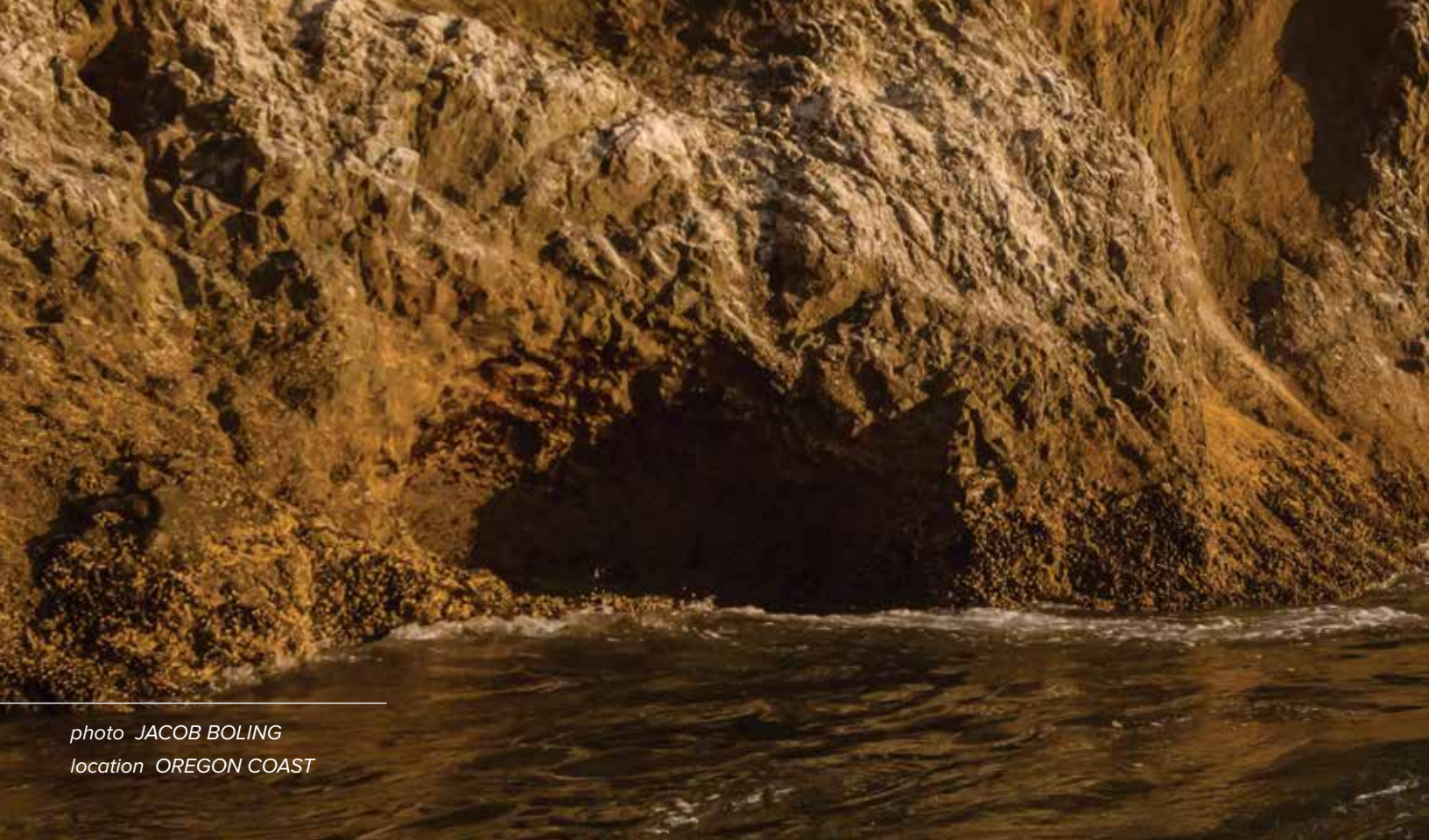
location OREGON COAST