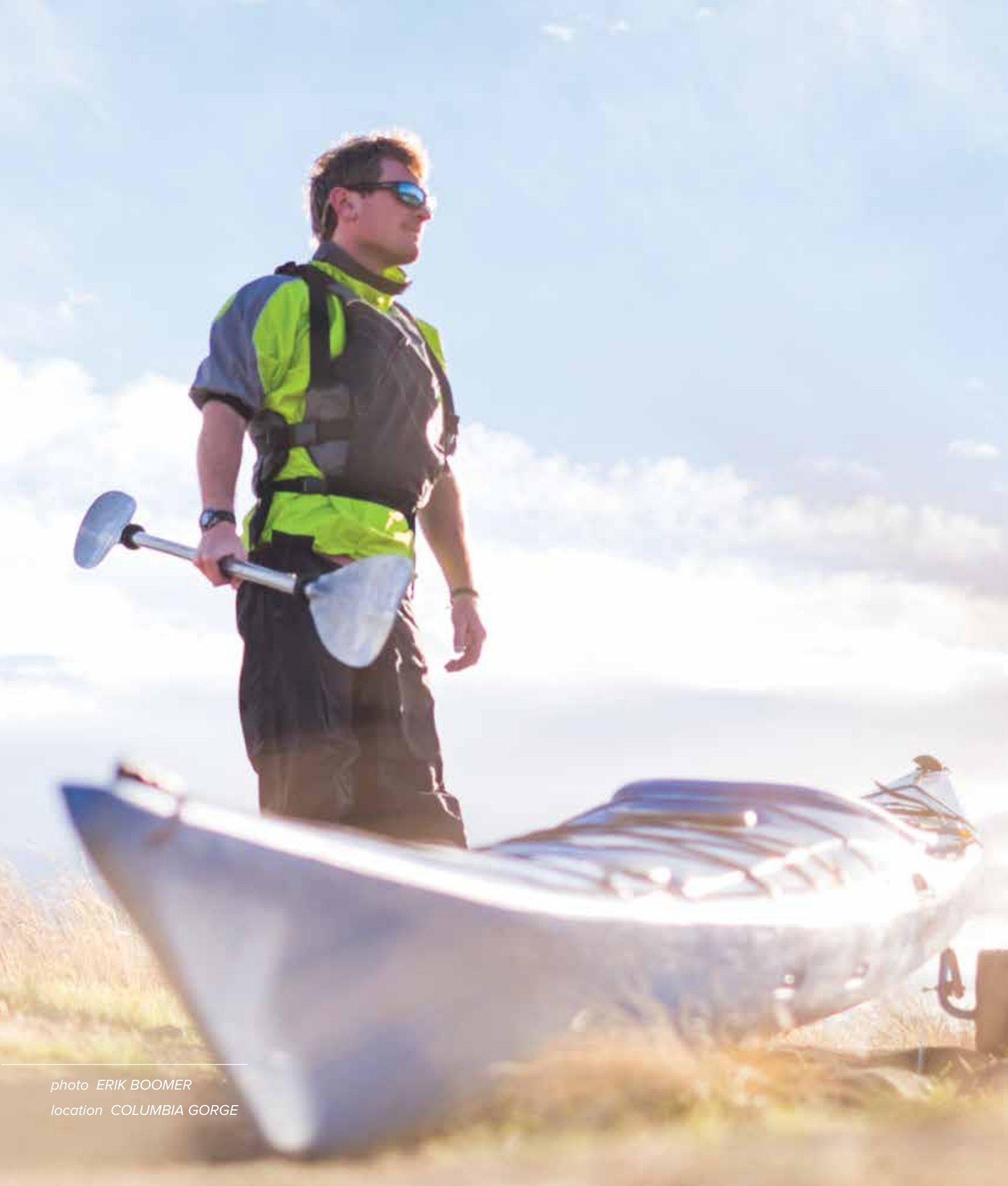
location COLUMBIA GORGE