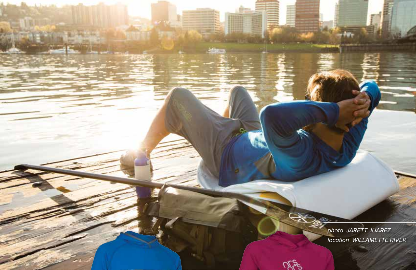
location WILLAMETTE RIVER