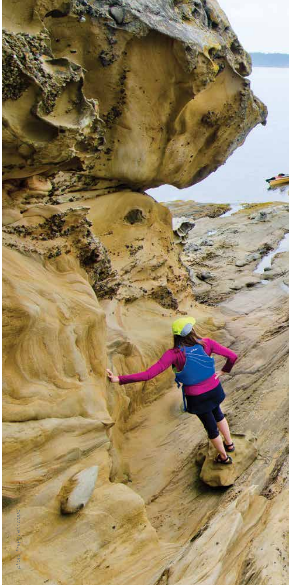
Women's Skirted Capris 15033.02 | $99.95 | XS-XL