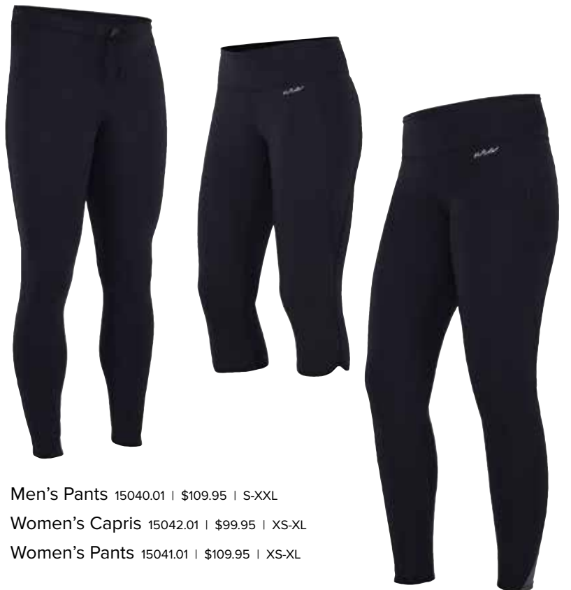
Men's Pants 15040.01 | $109.95 | S-XXL