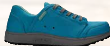
Women's 30044.02 | $79.95 | 6-11