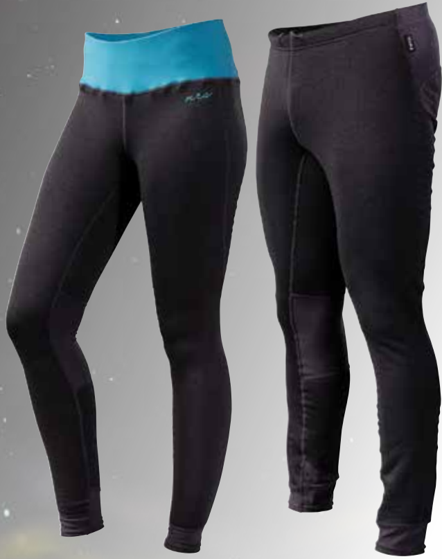
Women's Pants 10137.04 | $99.95 | XS-XL