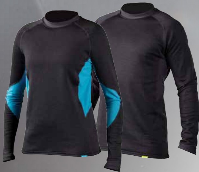
Women's Shirt 10135.04 | $109.95 | XS-XL