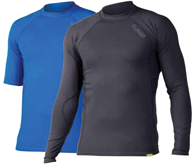
Men's Short Sleeve 10001.05 | $39.95 | S-XXL