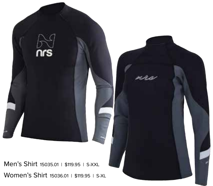
Men's Shirt 15035.01 | $119.95 | S-XXL