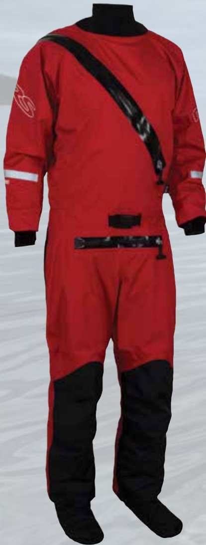
Explorer 22534.01 | $799.95 | S-XXL

We developed our new paddling suits for maximum comfort on extended tours, with smart details that keep you feeling good and performing at your best no matter how long you stay on the water. The neoprene neck gaskets are less constricting than latex, and battle-tested 4-Layer Eclipse™ fabric ensures dry performance. The Explorer gives you everything you need and nothing you don't for all-day excursions, while the full-featured Navigator delivers ultimate comfort and convenience for your most ambitious outings. [Imported]