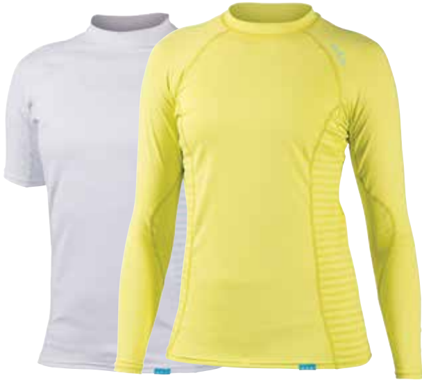
Women's Short Sleeve 10020.05 | $39.95 | XS-XL

H2Core Rashguard provides maximum protection from sun and abrasion with fabrics that wick moisture, breathe freely and dry quickly. Form-fitting pieces eliminate excess fabric for athletic performance, and friction-free seams ensure comfortable paddle strokes. Updated for 2016 with a lighter weight, more flexible technical fabric and new styling. UPF 50+ [Imported]