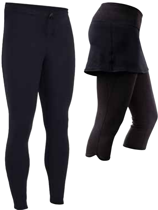
Men's Pants 15012.02 | $99.95 | S-XXL