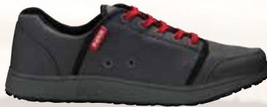
Men's 30043.02 | $79.95 | 8-13