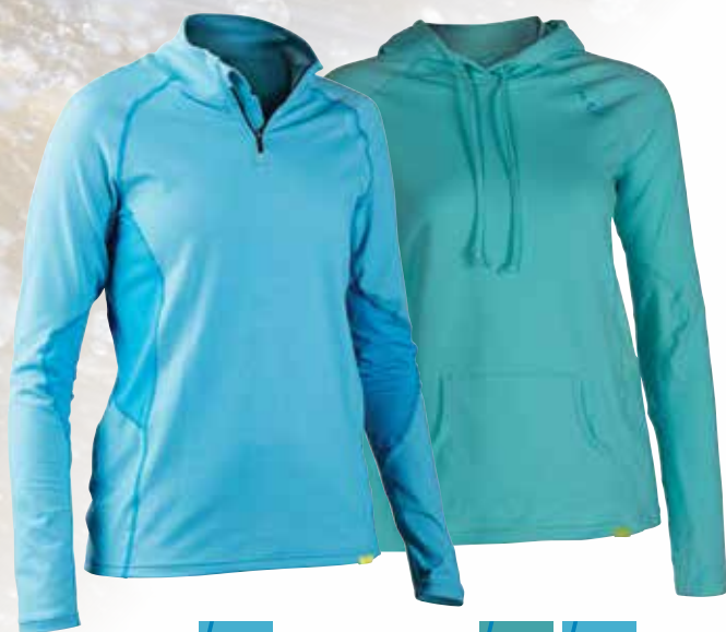
Women's Zip Neck 10119.02 | $64.95 | XS-XL