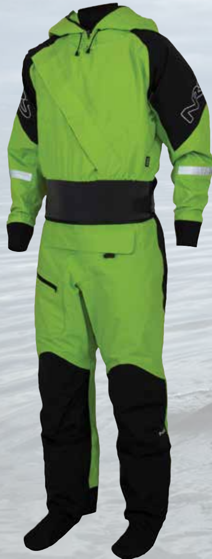
Navigator 22535.01 | $999.95 | S-XXL