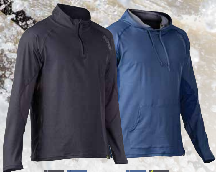
Men's Zip Neck 10118.02 | $64.95 | S-XXL

Put on a piece of H2Core Lightweight apparel and you'll wonder how you lived without it. The brushed fabric is soft as your favorite flannel, yet dries quickly, wicks moisture and protects your skin from harmful rays. Its mid-weight weave is perfect for evenings, mornings and cool afternoons—on the water, in camp, or around town. Updated for 2016 with a lighter weight, more breathable technical fabric and new styling. UPF 50+ [Imported]