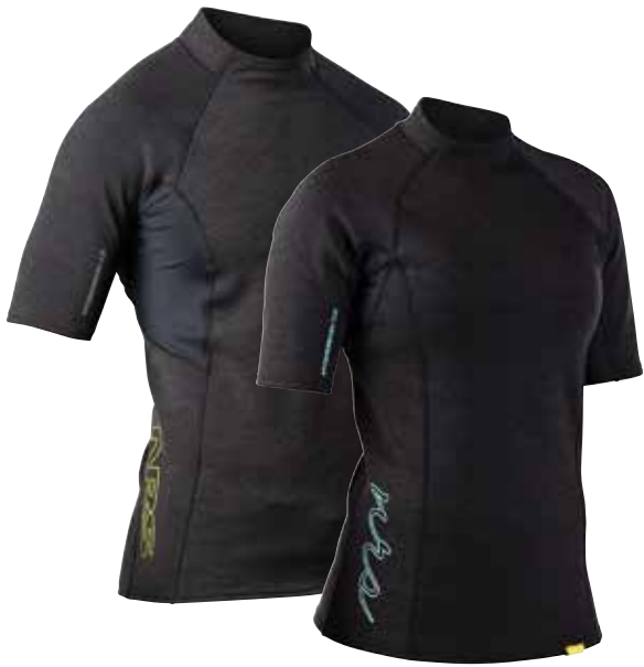
Men's Short Sleeve 15001.05 | $79.95 | S-XXL