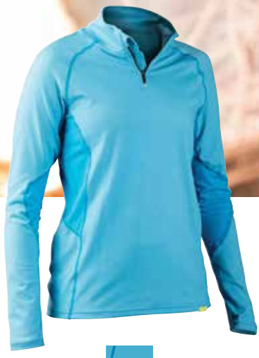
Women's Lightweight Zip Neck 10119.02 | $64.95 | XS-XL [Imported]