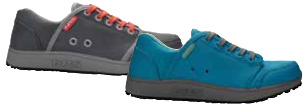
Women's 30044.02 | $79.95 | 6-11