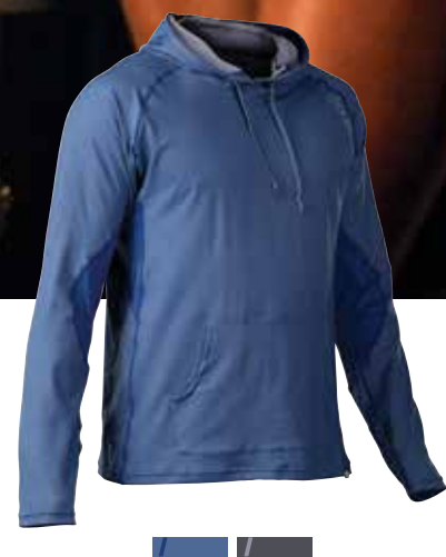
Men's Lightweight Hoodie 10120.02 | $64.95 | S-XXL [Imported]