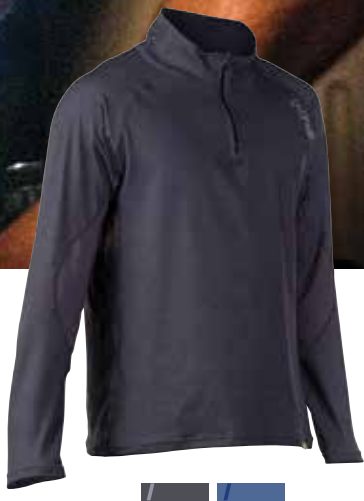
Men's Lightweight Zip Neck 10118.02 | $64.95 | S-XXL [Imported]