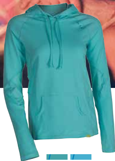
Women's Lightweight Hoodie 10121.02 | $64.95 | XS-XL [Imported]