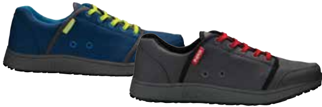
Men's 30043.02 | $79.95 | 8-13

When we were kids, a simple pair of sneakers took us everywhere we wanted to go, from the playground to the pond and back to the house in time for supper. With the Crush, we've built that same idea into a technical shoe that's equally capable in the boat, on the bank and at the barbecue. We made the upper breathable, quick drying and tough enough to last a nonstop season. We gave it a crushable heel and tuned the interior for barefoot comfort. Then we chose the stickiest rubber we could find and stamped our Idaho soul onto the sole, because playing in our backyard makes us feel like kids again. [Imported]